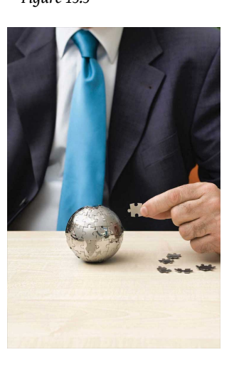
Controls allow you to align the pieces with the big picture.