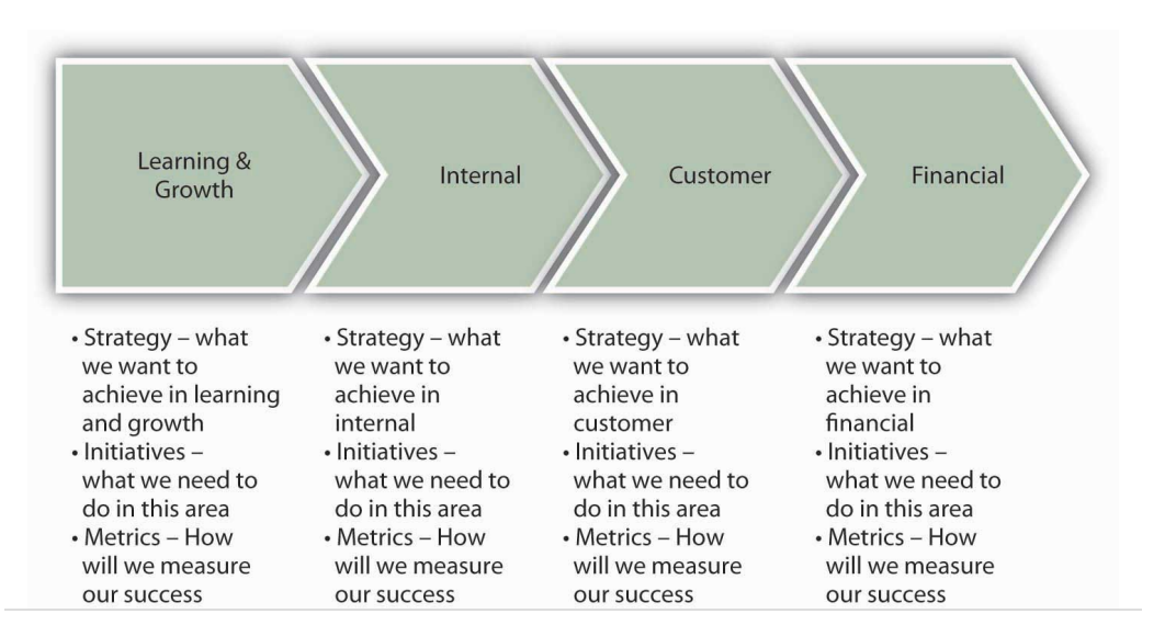
Figure 15.11 The Strategy Map: A Causal Relationship between Nonfinancial and Financial Controls