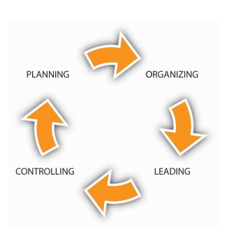
Figure 15.4 Controls as Part of a Feedback Loop

Why might it be helpful for you to think of controls as part of a feedback loop in the P-O-L-C process? Well, if you are the entrepreneur who is writing the business plan for a completely new business, then you would likely start with the planning component and work your way to controlling—that is, spell out how you are going to tell whether the new venture is on track. However, more often, you will be stepping into an organization that is already operating, and this means that a plan is already in place. With the plan in place, it may be then up to you to figure out the organizing, leading, or control challenges facing the organization.